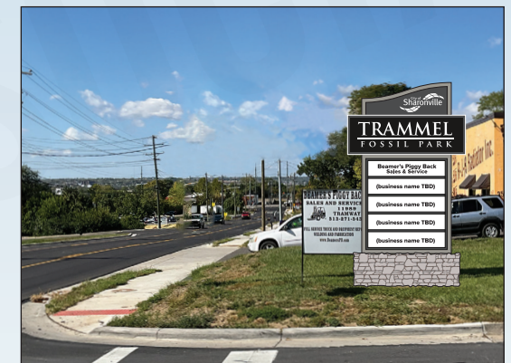
Scale: 3/32" = 1'-0"

*After zoning approval, manufacturing methods may be subject to change. *Colors may not be exact as shown because of printer limitations. Refer to actual material color charts for true color representation.